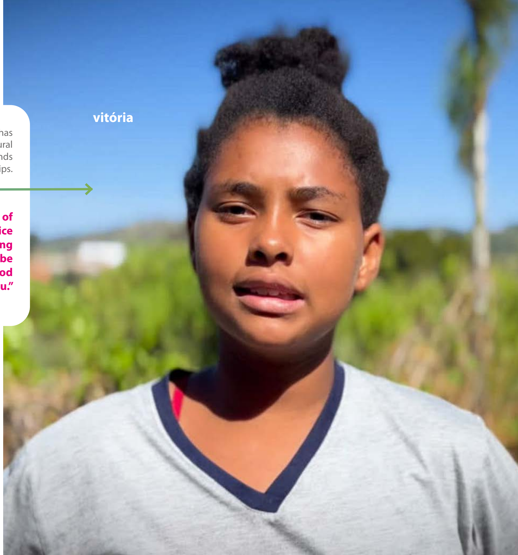
photo: vitória city: são josé do rio pardo (sp) frente: cpfl young generation